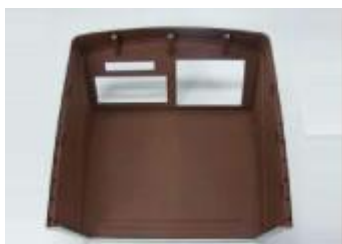
Electric conduction paint inside a product

By applying it to the inside of an electric product, it makes electric current transmission smooth and it is an effective measure against a noise. Ground treatment, electric wave prevention, and magnetic preventive measures are more strongly demanded with the thin shaping product or a miniaturization. This paint contributes to superior performance and miniaturization of apparatus.